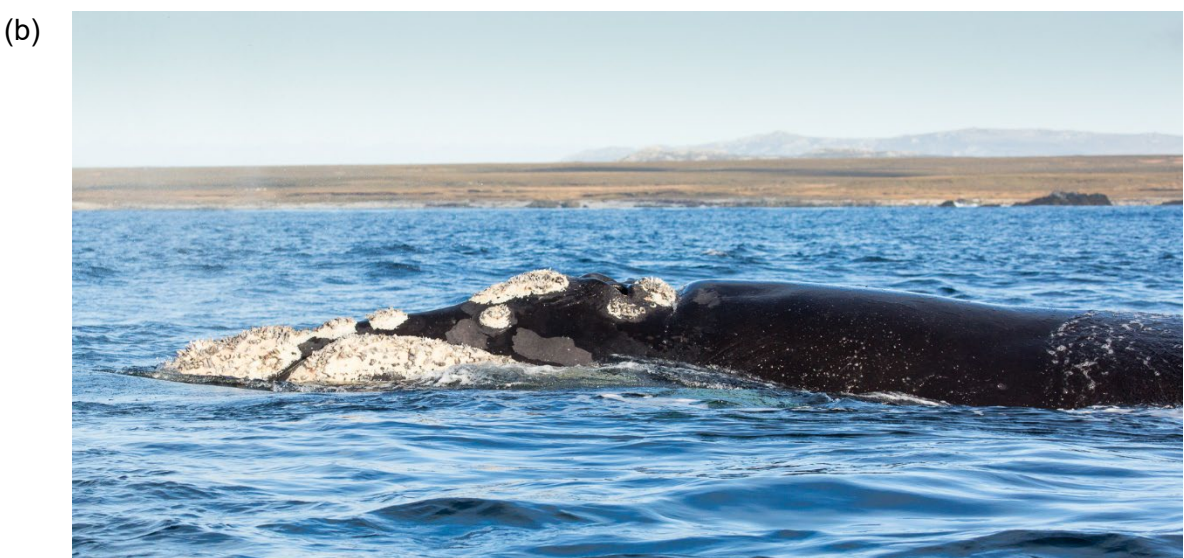
Figure 1. Project study species in the Falkland Islands: (a) sei whale and (b) southern right whale.

DPLUS126 aims to address some of these critical questions, including the first attempt to carry out satellite telemetry on whales in the Falklands, which will provide detailed fine-scale data on the movements and depth profiles of whales in, and potentially beyond, Falklands' waters. A winter aerial survey will be carried out to assess southern right whale abundance in regions adjacent to the north-east Falklands, and calibrated Unmanned Aerial Vehicles (UAVs) will measure the body size parameters of right whales via photogrammetry to assess their health. This suite of work will be carried out over two field seasons (2022 and 2023) using aerial and boat platforms. Boat surveys will focus on the coastal waters of the north-east Falklands, particularly Berkeley Sound during summer and the coastline north to MacBride Head during winter (Figure 2).